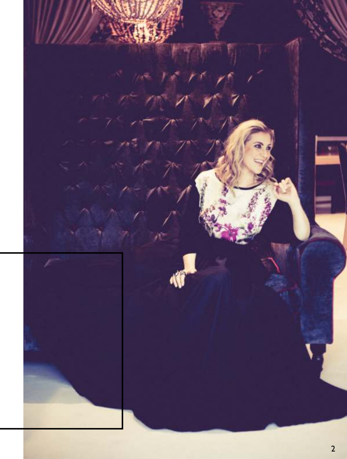
Image consultancy is one of the few professions offering more and more individuals the chance of earning a professional income both at a young age, as well as past the standard age of retirement. In fact, the majority of your clients might even fall in more or less the same age group as you, simply because people seem to relax and relate better with their peers the older they become.